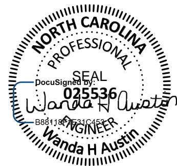
Division 14 Contract Officer